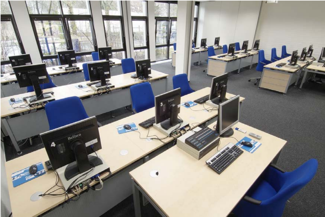
Training course rooms with the zena system (maple decor) and a conference room with no limits (middle photo). silent rush swivel chairs and tubular-base chairs.